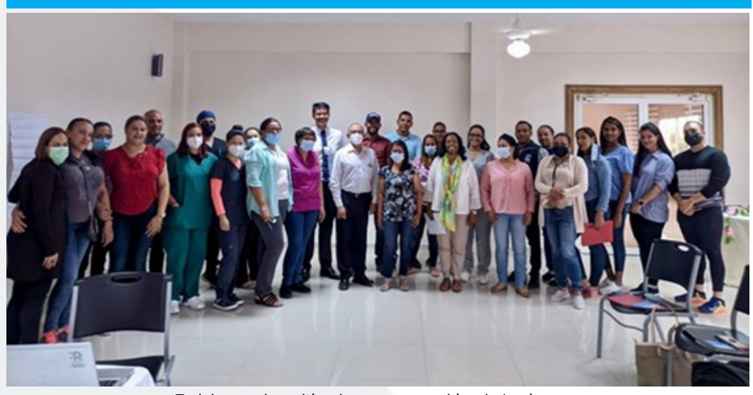
Training session with primary care providers in Jarabacoa

In the months leading up to my trip to Jarabacoa, Dominican Republic, I had gathered that the community's mental health resources are extremely limited. However, it was not until I physically reached Jarabacoa and started meeting with patients at our partner site, Instituto Terapéutico y Psicológico para la Familia (INTEP), and visiting local clinics that I realized the gravity of the situation. I felt disheartened hearing stories of individuals traveling over three hours each way to see a psychiatrist; patients not being able to fill prescriptions for months due to medication shortages; and families resorting to keeping patients in locked rooms within their homes due to a lack of inpatient care.